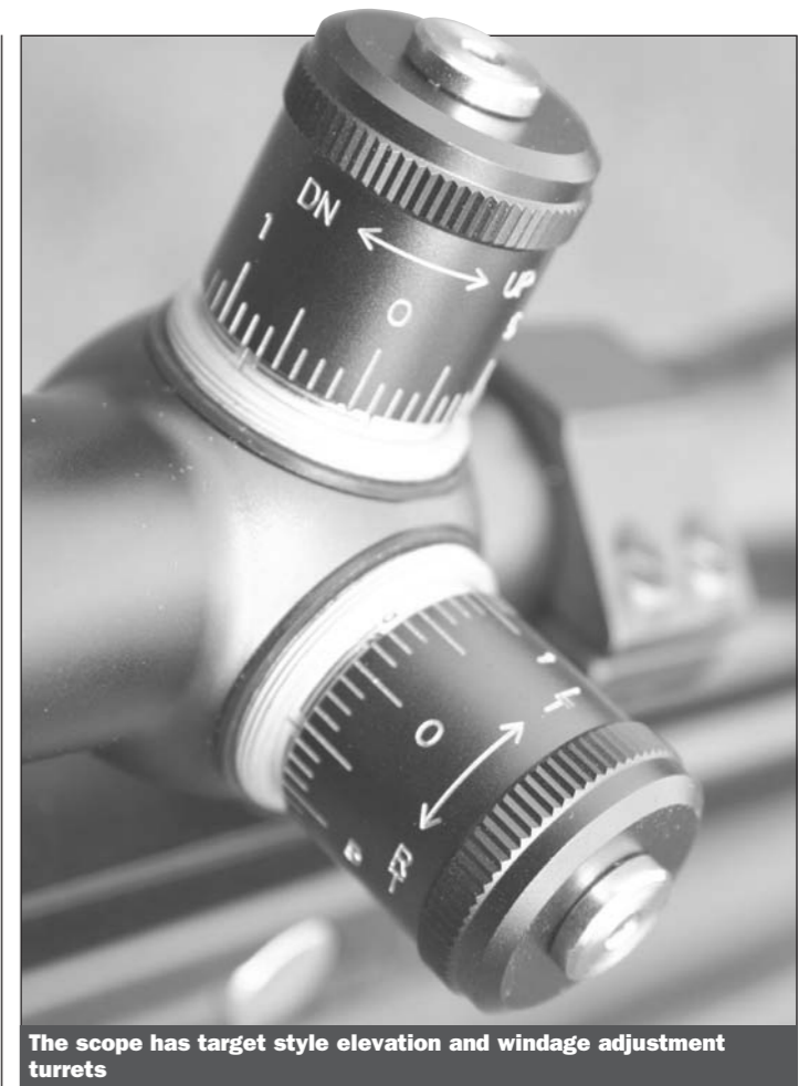
The scope has target style elevation and windage adjustment turrets

to fill in. The added twist over the now standard looking mil dot reticle is the addition of short horizontal line intersecting three of the dots. One is set through the second dots vertically up from the center, one is set on the second dot down from center and the last on the fourth dot down. The length of the lines vary, the top two are 2 mils long and the