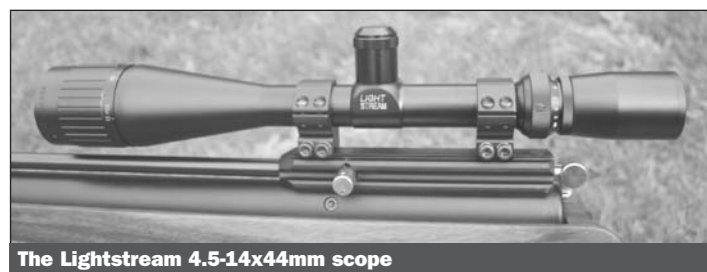
The Lightstream 4.5-14x44mm scope

Lightstream scopes may not be a name familiar to you, but Tim Finley reckons it soon will be