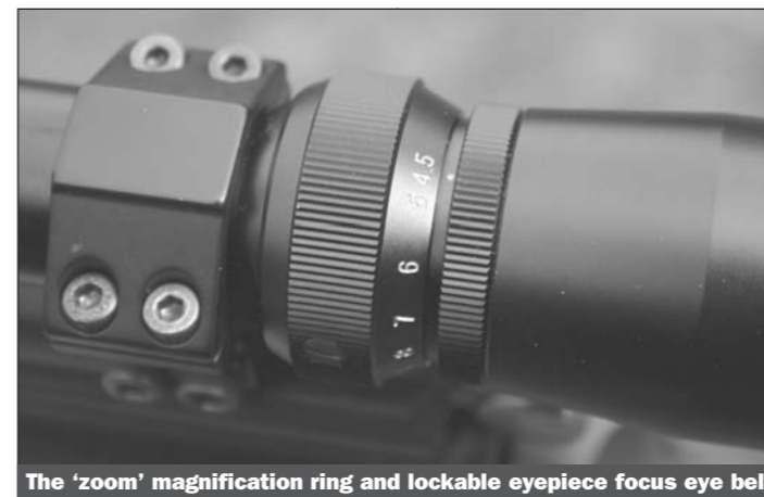
The 'zoom' magnification ring and lockable eyepiece focus eye bell

Lightstream scopes may not be a name familiar to you, but Tim Finley reckons it soon will be